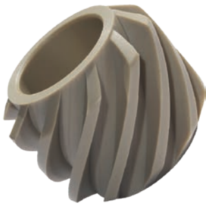
Packaging PEEK materials