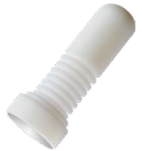
Packaging PTFE materials