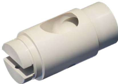
Food PEEK materials