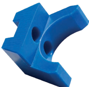
Packaging PE materials