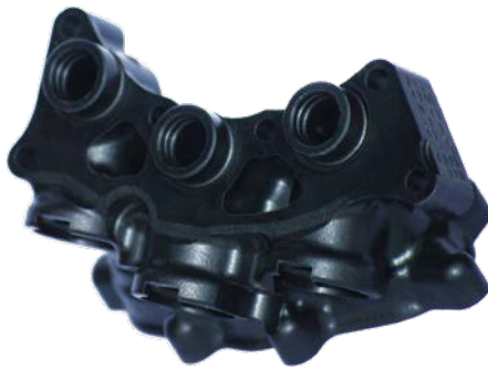
Automotive material PA66GF30