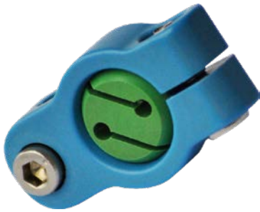
Medical Industry PEEK materials