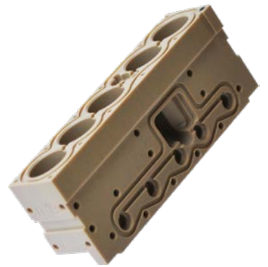
Chemical/Pharmaceutical PEEK materials