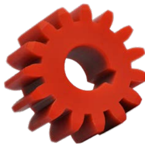
Packaging Material PA6C