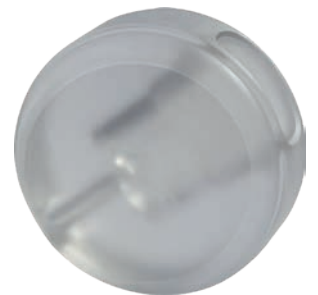
Pharmaceutical PC materials