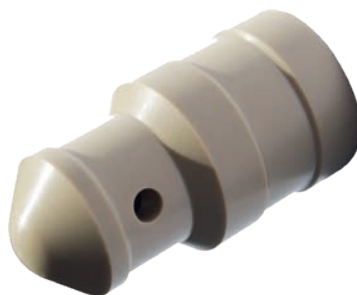
Food PEEK materials