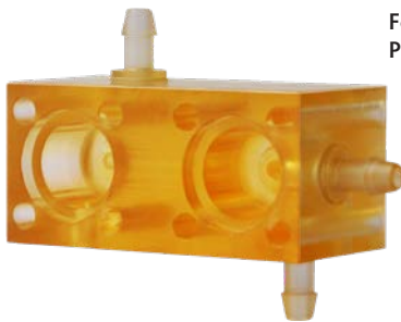
Medical Industry PSU materials